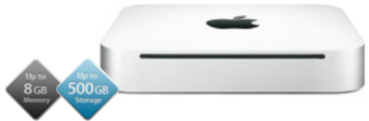
Mac mini http://www.apple.com/au/macmini/