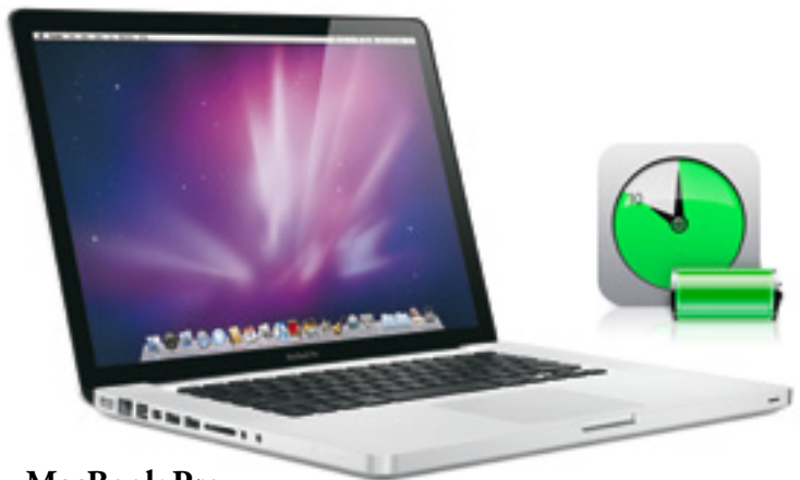
MacBook Pro http://www.apple.com/au/macbookpro/